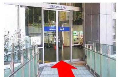
(1) Entrance "Sannomiya Bus Terminal" on the ground floor of M-INT KOBE