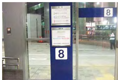
(3) Shuttle bus departs from the bus stop No.8.